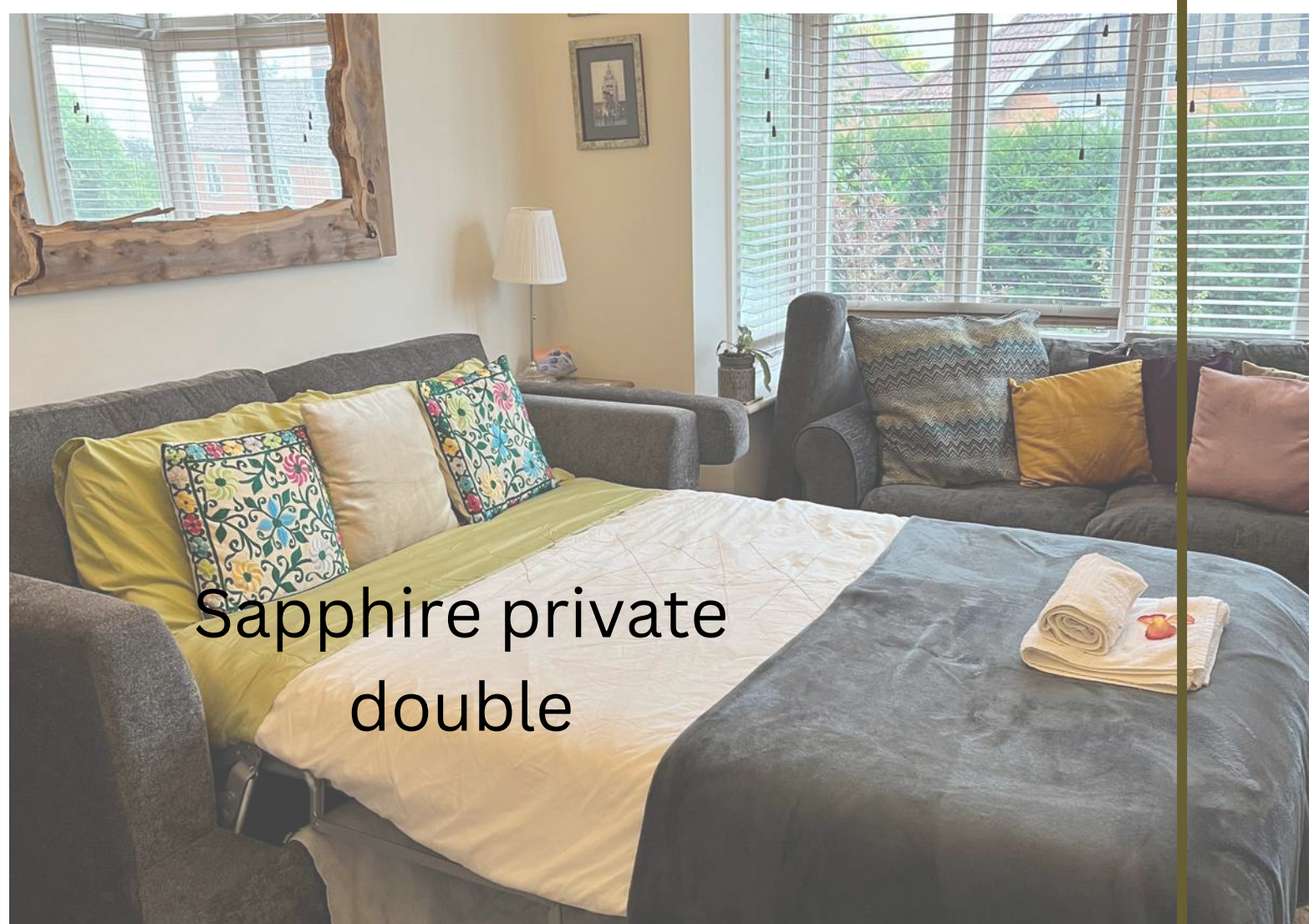
Sapphire private double